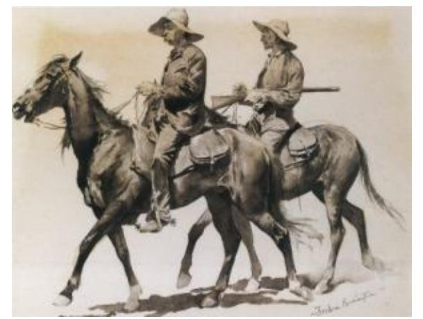
Figure 46: Florida Cowboys 1895 by Frederick Remington.

In more remote areas, they became Cow Hunters who rounded up herds of wild Cracker Cattle in the Kissimmee River valley, using bullwhips from which they got their "Cracker" nickname, to keep the cattle under control.