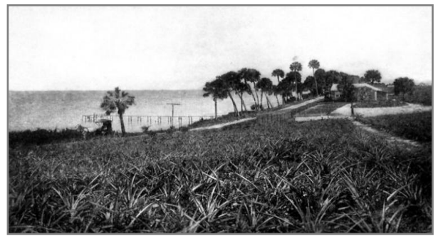
Figure 48: Early Pineapple Plantation on the Indian River.

Lucie Rivers were businessmen and entrepreneurs who rekindled those commercial dreams and gave new breath to those industries.