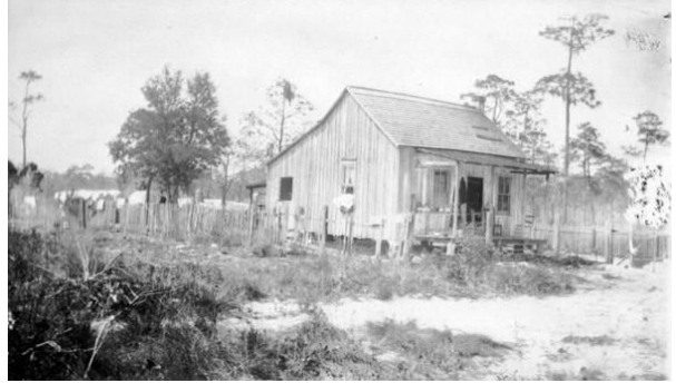
Figure 47: Early Florida Cracker Cabin.

When not hunting cattle, they planted vegetables and citrus on the high ground, hunted deer and turkeys, fished in the rivers and the lake, and built homes out of roughcut, virgin cypress that kept out the alligators, panthers, bears, and poisonous snakes.